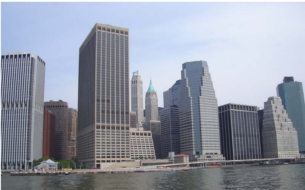
See you in New York!!!